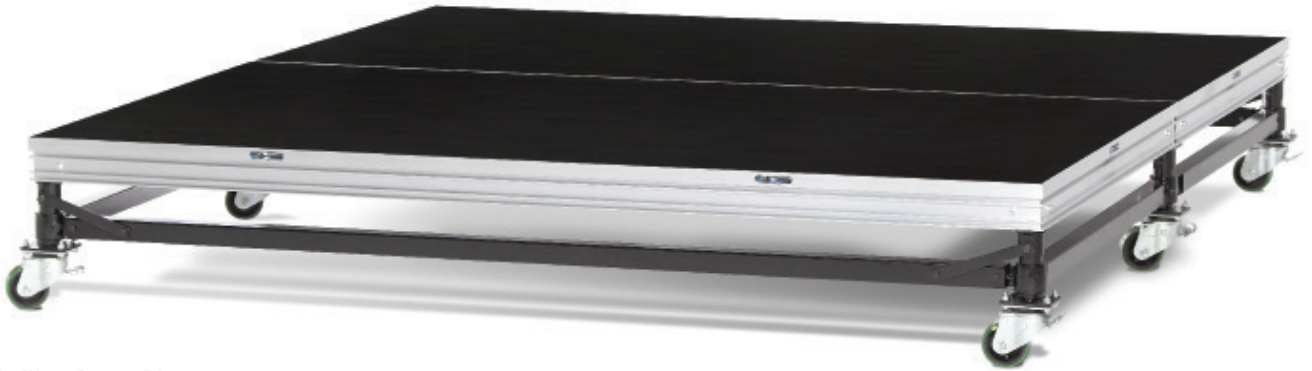
Rolling Drum Riser

Staging Concepts' Rolling Drum Riser complements your performance stage set-up. Its understructure has dual locking casters to keep the riser in place during performances. When not in use, its understructure collapses for easy storage and transport. The Rolling Drum Riser is for use with SC90 Platforms.