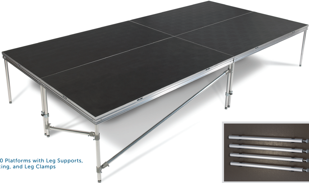
SC90 Platforms with Leg Supports, Bracing, and Leg Clamps

Our SC90 Leg Supports, used with the SC90 and SC97 Platforms, guarantee maximum durability and strength; the leg supports feature the same high quality aluminum that is used on our platforms. The leg supports are available in both fixed and adjustable heights, and have bracing and leg clamps available for extra stability and rigidity at higher elevations. In addition, our leg supports can be used with the most challenging custom applications on stages, seating and choral riser systems.