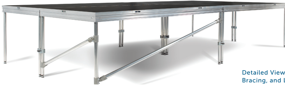
Detailed View of SC90 Leg Supports, Bracing, and Leg Clamps