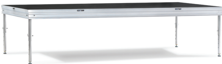
SC90 Platform with SC90 Adjustable Leg Supports