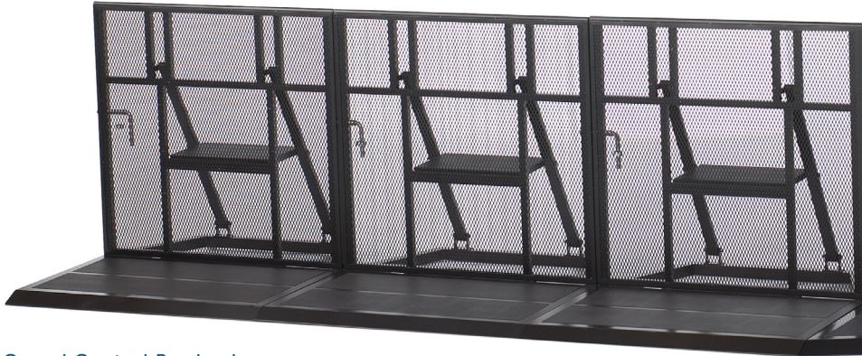
Crowd Control Barricades

Staging Concepts' Heavy-Duty Crowd Control Barricade is manufactured to withstand the most demanding circumstances of any venue. These lightweight, steel and aluminum constructed barricade sections only require two people for set up and takedown. In addition, each section is equipped with the most effective – and yet the most simple – locking mechanism on the market, so that barricade walls of all sizes take only minutes to assemble. Each section can be folded compactly to fit almost any storage space. Staging Concepts' modular Crowd Control Barricade is sure to complement any performance.